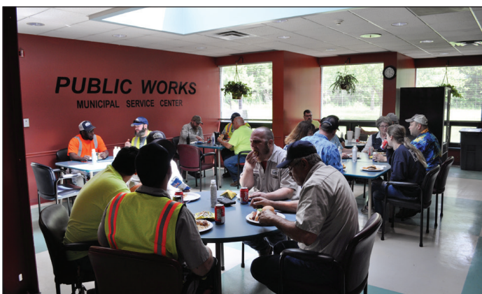
Members of the Public Works team celebrated "Public Works Appreciation" week earlier this spring with a luncheon and a heavy equipment obstacle course to help with training on city vehicles.

Trash bag delivery is the last Saturday in September. Additional trash bags can be purchased at the City Clerk's Office for $7.