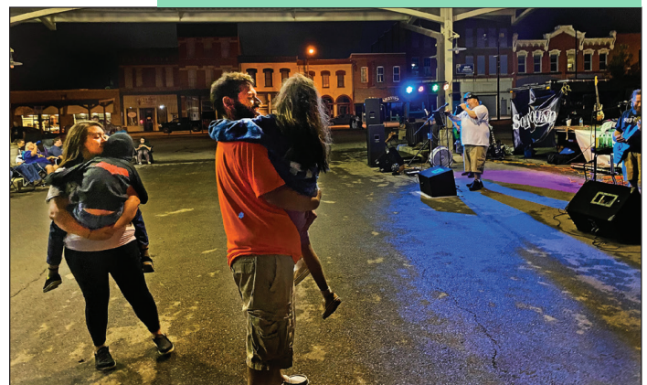
Times with moms and dads are the best times: Leavenworth Main Street organization held several of its free "Summer Concert Series" music events monthly at Haymarket Square this summer. Events like these are listed on the Convention and Visitors Bureau website, visitleavenworthks.com .