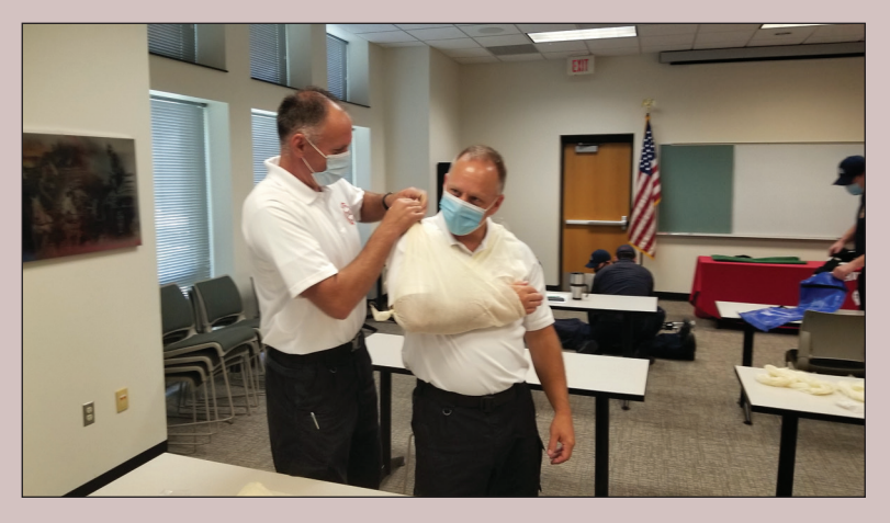
Firefighters and administrative staff use masks regularly while training with each other and among the general public when responding to emergencies. According to the CDC, masks not only protect the wearer, but also those around them. Guidance has changed about masks during the pandemic. In April, the CDC began putting out information that masks do have value in preventing the spread of disease. Fire Department and City staff have also been coordinating masks to give away to the general public.