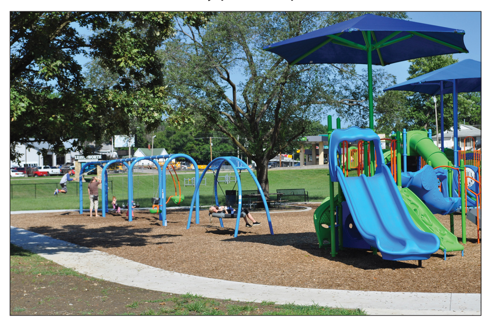
Funded by the City's Capital Improvements Program budget, Stubby Park received new playground equipment, expanded parking lot, new concrete path and new fence. The sledding hill remains at Stubby Park.