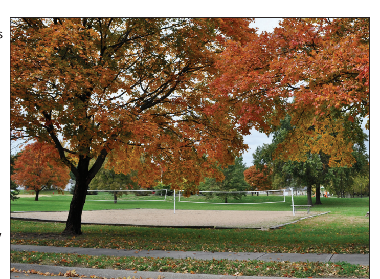
Sand volleyball courts at David Brewer Park, 18th and Ottawa streets.

Through this program, old trees are replaced and new areas rejuvenated. All contributions to this program are