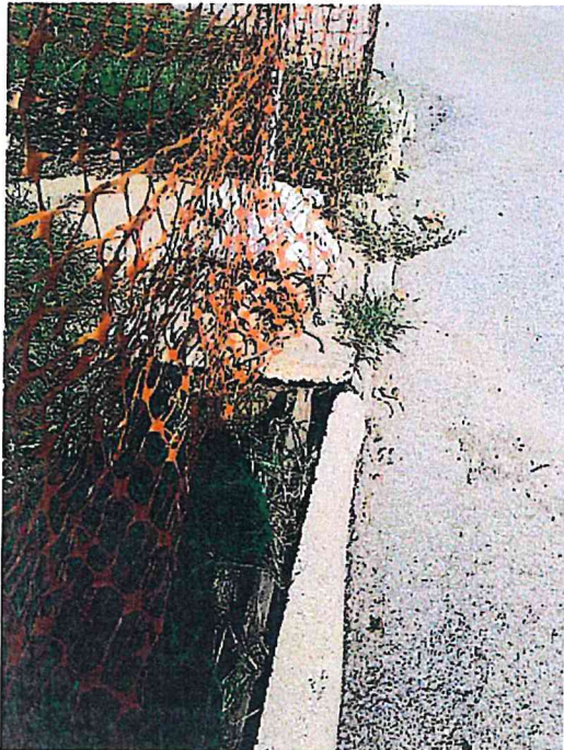
Sinkhole Undercutting the Street

The project is necessary due to multiple failures in the old system that has created sinkholes (marked by orange fencing) along the project limits. These failures continue to worsen and are coming closer to an occupied structure. This location is near the bottom of the drainage basin so a significant amount of water is captured from upstream and conveyed through this area. This results in larger piping and structure sizes to accommodate the volume of storm water that flows through the area and dumps into the MO River just downstream of this project.