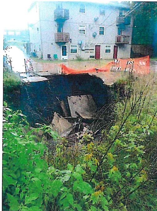
Sinkhole Near Apartments