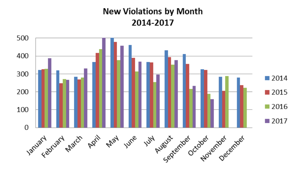
*Down one Code Enforcement Officer September/October 2016 *Down one Code Enforcement Officer September/October 2017