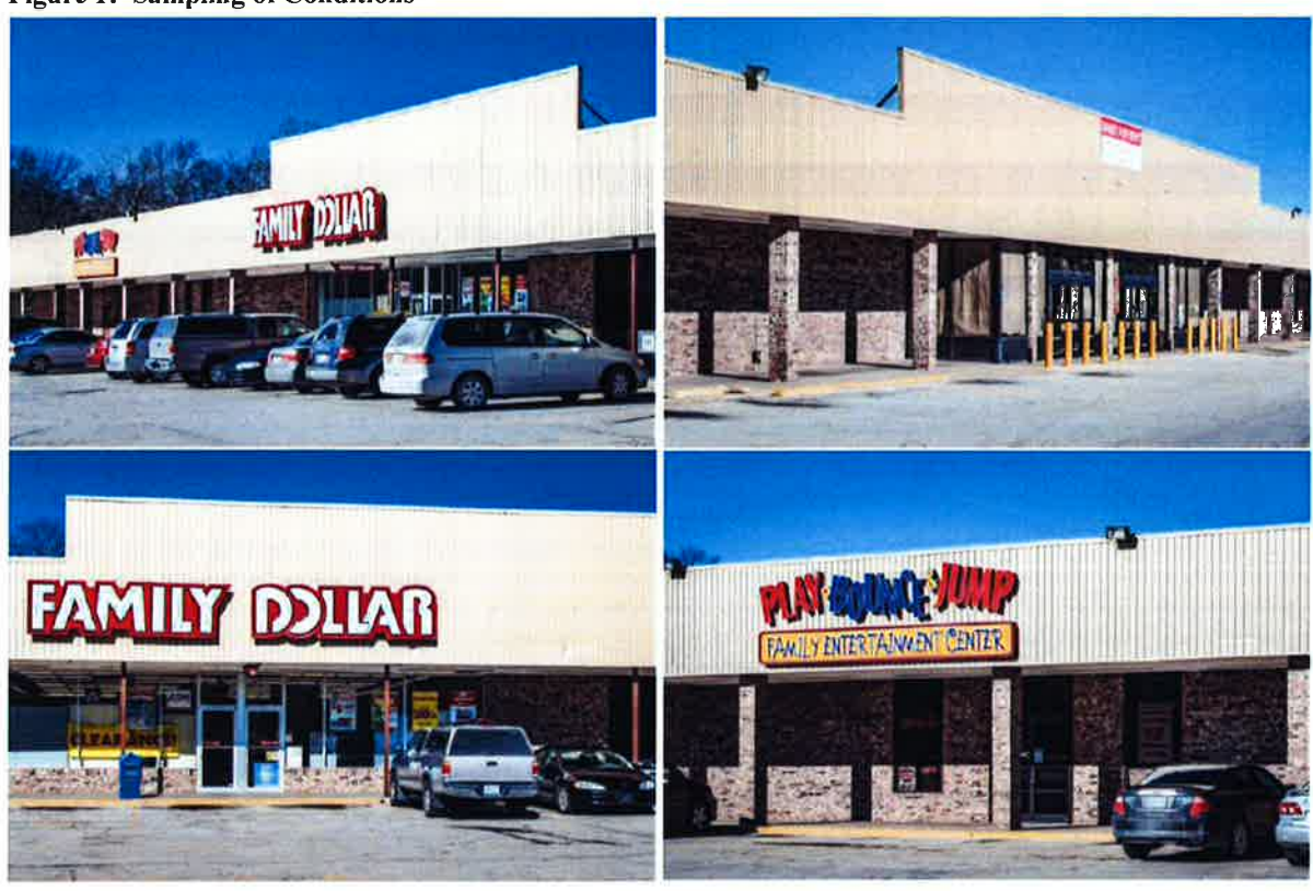
Figure 1: Sampling of Conditions