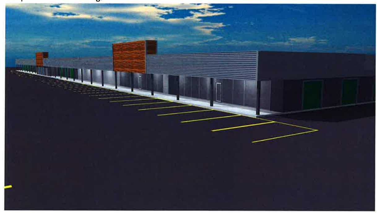
Sample Exterior Renderings