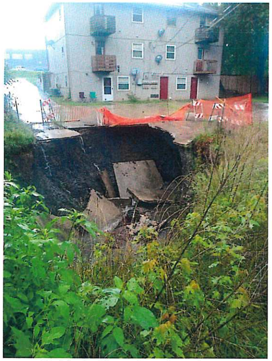
Sinkhole Near Apartments