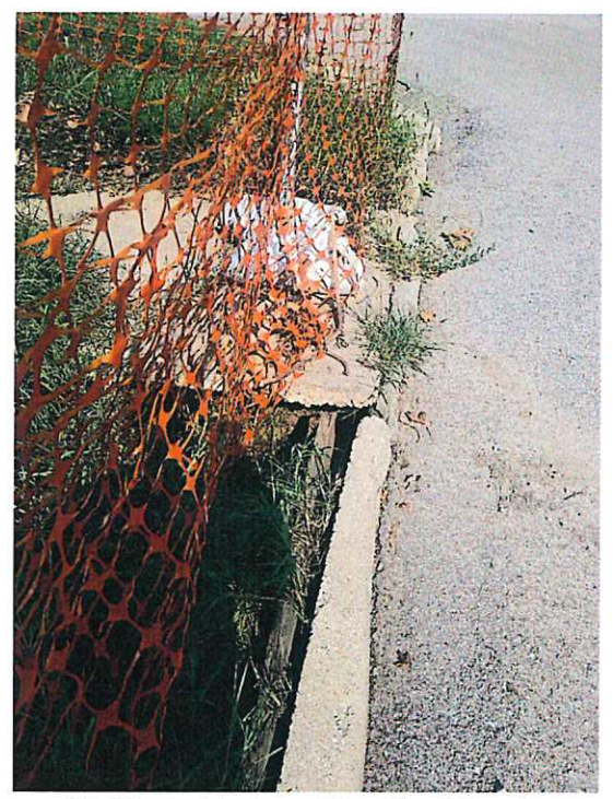
Sinkhole Undercutting the Street

The project is necessary due to multiple failures in the old system that has created sinkholes (marked by orange fencing) along the project limits. These failures continue to worsen and are coming closer to an occupied structure. This location is near the bottom of the drainage basin so a significant amount of water is captured from upstream and conveyed through this area. This results in larger piping and structure sizes to accommodate the volume of storm water that flows through the area and dumps into the MO River just downstream of this project.