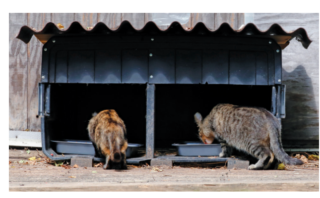
Feeding stations provide cats with a designated area to eat. Find tips for building or buying feeding stations at alleycat.org/FeedingStations.