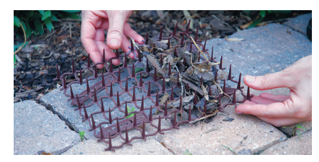
The "scat mat" is a safe deterrent to use in your garden.