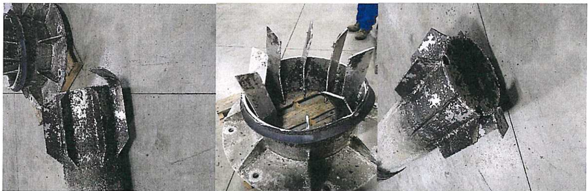
No. 21-17 WPC Repair Mast Assembly Trickling Filter #1

During routine inspection in February 2021, Trickling Filter No. 1 was found to be not turning. At the time of the failure, C&B Equipment was in the process of repairing Filter No. 3 and had the needed lifting equipment on-site to remove the mast from Filter No. 1. The mast holds the distributor arms and allows them to spin which disperses the water evenly across media. C&B crews performed a detailed inspection and found pitting on the aluminum mast from contact with the wastewater. This pitting and corresponding metal fatigue caused the mast to fail.