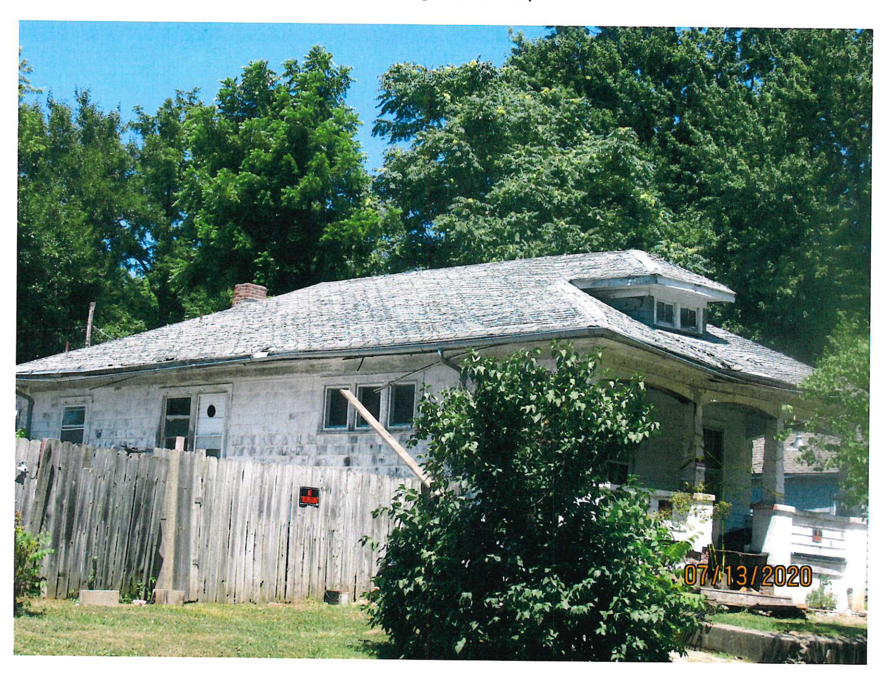
824 Osage Street - July