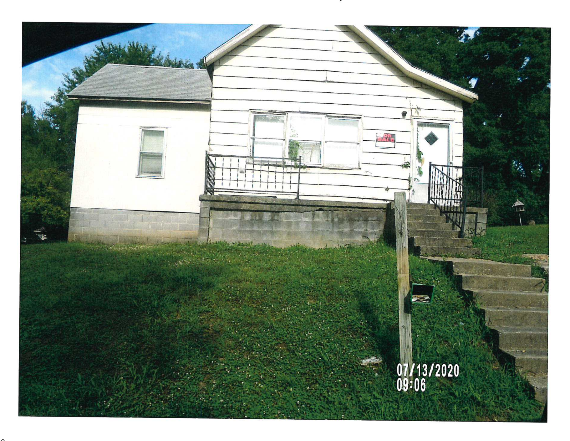
1914 W. 7<sup>th</sup> Street - July