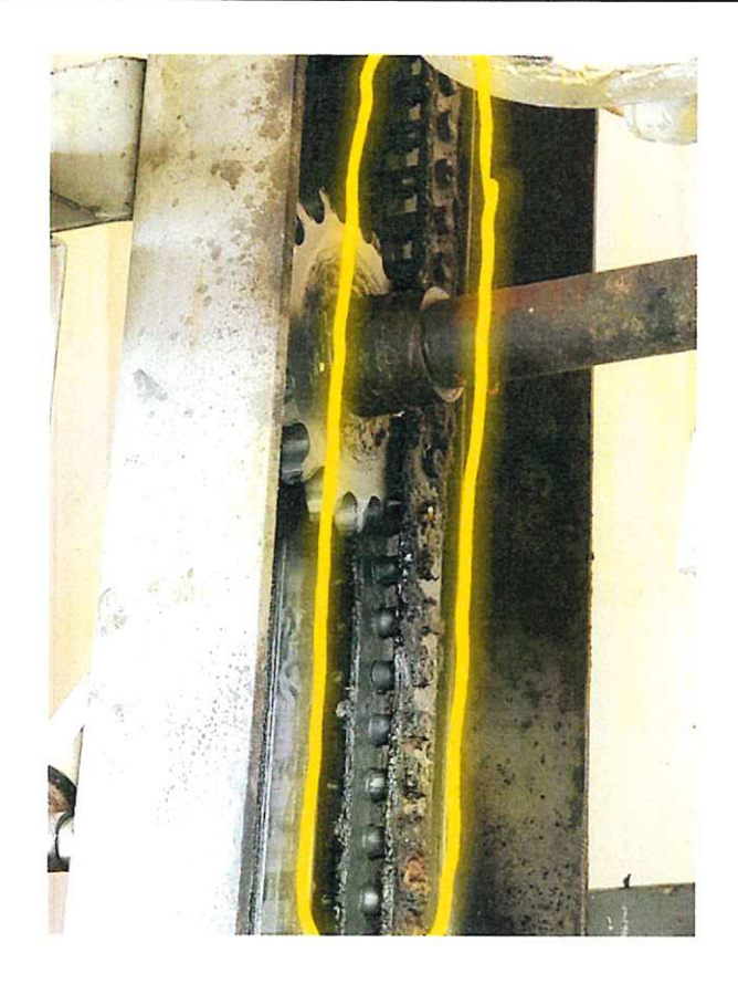
ATTACHMENTS: November 12, 2019 Policy report Revised Quote (3/25/2020)