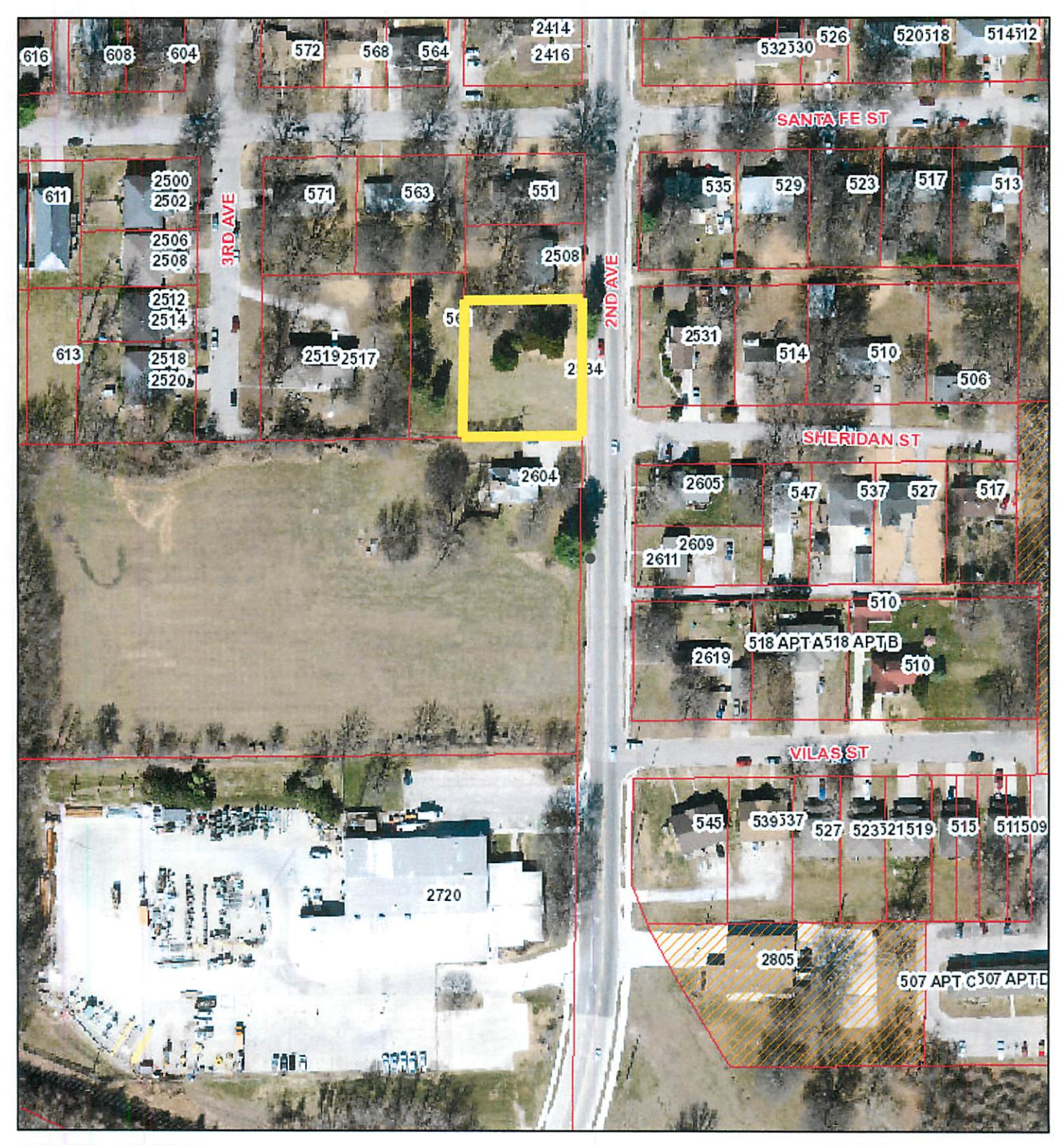
8/16/2018, 1:53:35 PM